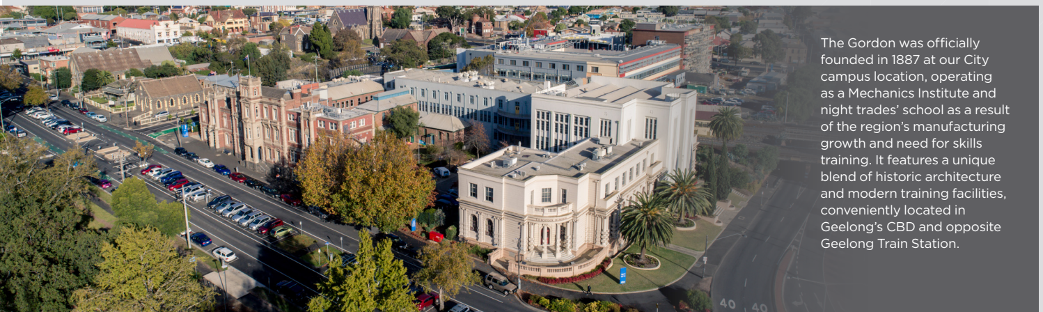
The Gordon was officially founded in 1887 at our City campus location, operating as a Mechanics Institute and night trades' school as a result of the region's manufacturing growth and need for skills training. It features a unique blend of historic architecture and modern training facilities, conveniently located in Geelong's CBD and opposite Geelong Train Station.

The Gordon has two major campuses in Geelong, a port city located on Corio Bay and the Barwon River, in the state of Victoria. Located 75 km south-west of Melbourne, it is the second largest Victorian city, with an estimated urban population of 268,277 (as of June 2018) and is Australia's second fastest growing city. The Gordon has also expanded into the growing Wyndham region (Werribee and Hoppers Crossing campuses), which presents a set of specific needs, including rapid population growth, increasing education attainment, a socially diverse population, and a changing economy and industries.